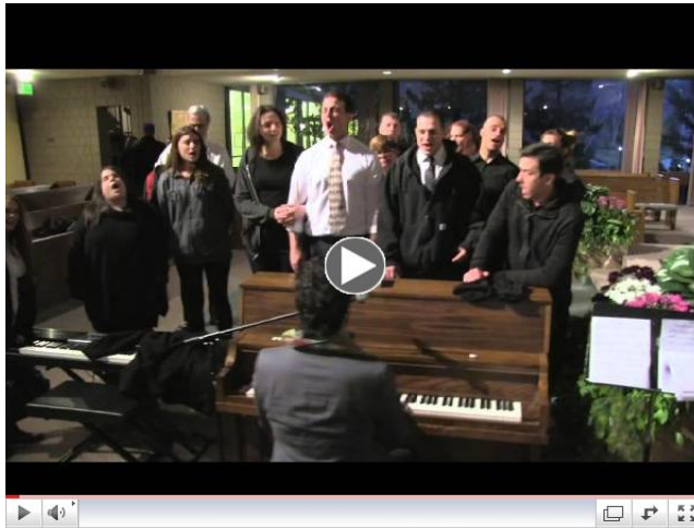
Freedom Song Trailer 2013

WHEN: Sunday, April 5th. Performance at 6:30 p.m. followed by an abbreviated Seder.